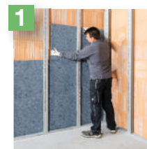
Laying the first layer of insulation