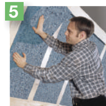
Also suitable for useable attics