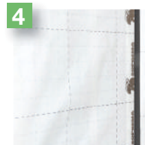
Fixing the vapour barrier with double-sided adhesive, creates a technical vacuum then install the facing plates